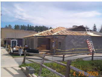
First Citizens Bank

Building permit applications for the first quarter of 2009 are off pace slightly from 2008. There is still a lot of building activity, especially single-family additions and renovations. As far as commercial projects, the Chetola conference room and spa addition is nearing completion and the First Citizens Bank addition is well underway on Main Street.