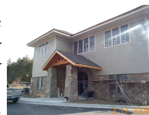
Blowing Rock Fire & Rescue

The Planning Office has also received applications for new commercial development review in the past three months. The projects that require conditional use permits include: CUP 2007-14 for two new condo buildings at Chetola Resort (April Planning Board – pending), CUP 2008-01 Kilwin’s Ice Cream (approved March 2008), CUP 2008-02 Grover Robbins Pool (April Planning Board – pending), and CUP 2008-03 Ransom Street Restaurant/Retail (May Planning Board – pending). The Main Street Village (CUP 2007-04) project was tabled at the February Council meeting pending additional information.