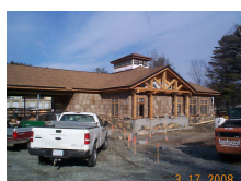
United Community Bank

Work is currently ongoing on several commercial projects at this time. The former Eugena’s Building on the 321 Bypass is being renovated into office/retail space. United Community Bank and the Blowing Rock Fire and Rescue buildings are nearing completion. The Chetola Conference Room project is underway at Chetola Resort along with completion of the remaining Cumberland condo building in the “Ponds” development.