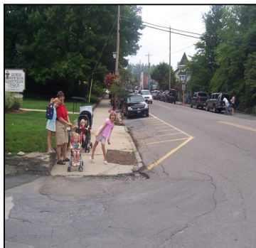
Before Chestnut Street Crosswalk

At the December 18, 2008 meeting, the Planning Board made a consensus recommendation to forward the Streetscape Plan to the Town Council for consideration.