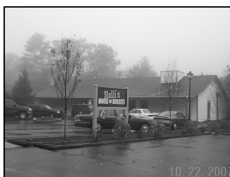
Holli's House of Biscuits

Construction began at Holli's House of Biscuits (CUP 2007-08) and the restaurant should be open for business in the next few weeks. The former Pearl China restaurant building is being renovated, parking and landscaping improvements are also planned.