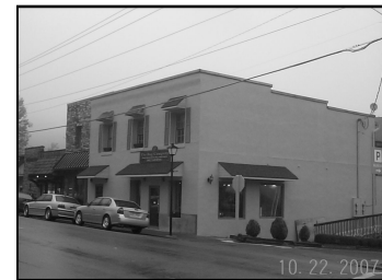
The Rug Company

The Rug Company exterior has been updated over the past month with new paint and awnings. Cultured stone wainscoting will be added in the next couple of weeks to blend in with the adjacent buildings.