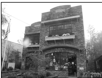
Hanna Family Trust

The Hanna Family Trust (CUP 2006-02) building on Main Street reached completion a few weeks ago. The main floor is open but the lower level retail, and upper level living units are going through final touches. A retail store and real estate office are currently occupying the first floor.