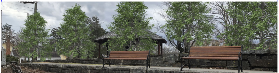
The Black Gum tree has an annual growth rate of 12" to 24" per year. The initial caliper of the front trees will be 4" to 5" at a height of 21 to 25 feet. The maximum mature sizes are expected to be between 35 and 50 feet. This species is known for its deep red, purple, and crimson coloring in the fall as depicted below in this rendering.