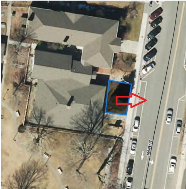
Town Hall facing Main Street