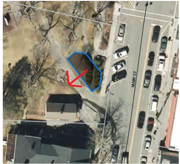
Memorial Park Facing 1888 Museum