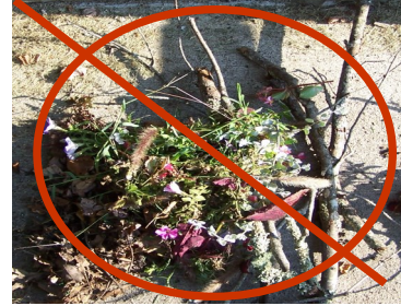
Yard debris should not be placed into one pile for pickup.

*Watauga County Landfill now operates an on-site household hazardous waste collection facility. The HHW (household hazardous waste) facility is equipped to accept a variety of toxic materials such as; household cleaners, paint, varnishes, stains, paint thinner/remover, solvents, pesticides, automotive liquids, etc. It is very important to dispose of these items correctly in order to keep ourselves and our environment safe and toxic free. For more information, contact the Watauga County Sanitation Office at (828)264-5305. The address of their collection site is 336 Landfill Road in Boone.