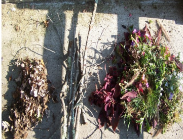
Yard debris should be separated into three piles: loose leaves, limbs, and plant debris.

The Town is planning the “Fall Semi-Annual Clean-Up” for the week of October 14th — 18th. This pick-up includes white goods, yard debris (leaves, tree branches, etc.), mattresses, etc. The Town can no longer pickup any containers with liquids such as paint cans (will pick up if it has kitty litter or oil dry in it) or propane tanks, electronics, shingles, pallets or tires. During this pick up, and anytime that you have yard debris, it should be separated into three piles: loose leaves, limbs, plants. Please do not block any ditches or drains. Residents do not need to call Town Hall to have their names put on a list. The Semi-Annual Clean-Up is offered in the fall and spring of each year. There is no charge for this service.