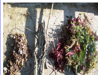
Yard debris should be separated into three piles: loose leaves, limbs, and plant debris.

The Town is planning the "Fall Bi-Annual Clean-Up" for the week of October 3-7. This pick-up includes white goods, yard debris (leaves, tree branches, etc.), mattresses, etc. The Town can no longer pickup any containers with liquids such as paint cans or propane tanks, electronics, shingles