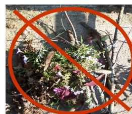
Yard debris should not be placed into one pile for pickup.

or tires. During this pickup, and anytime that you have yard debris, it should be separated into three piles: loose leaves, limbs, plants. Please do not block any ditches or drains. Residents do not need to call Town Hall to have their names put on a list. The Bi-Annual Clean-Up is offered in the fall and spring of each year. There is no charge for this service.